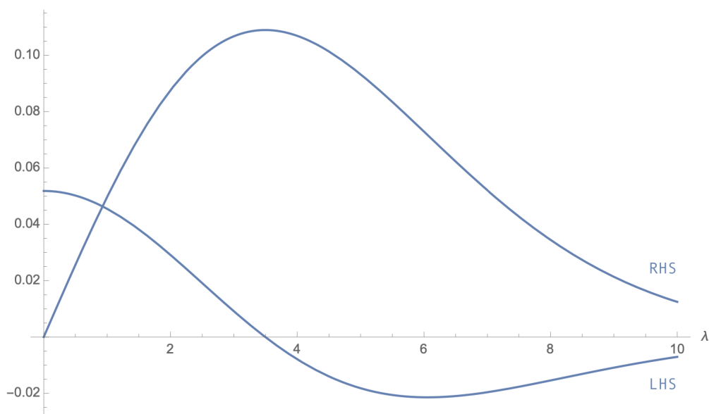
Figure 3: LHS and RHS of inequality (12)

Figure 3 shows the LHS and RHS of (12) for (\sigma_L^2, \sigma_H^2) = (4, 16) . As the plot shows, the LHS and RHS of (12) cross only once. We, thus, have a unique threshold for the overconfidence bias \lambda for which (12) holds as an equality. The point of intersection between the LHS and RHS represents the threshold \bar{\lambda}_2 .